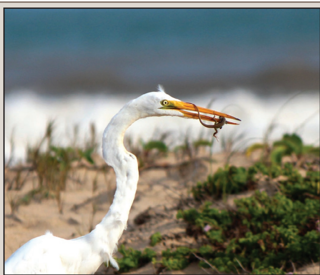
FIG. 1. Great Egret predation upon Cnemidophorus ocellifer at Mosqueiro's Beach, Aracaju, Brazil.

On 19 September 2012 at 1530 h during fieldwork at Mosqueiro's Beach, Aracaju, Brazil (11.0885°S, 37.1166°W) we observed a predation attack by a Great Egret on a C. ocellifer . The egret was observed walking slowly along the dunes, and suddenly changed its stance, beginning to walk faster with the neck stretched toward and facing upright. It then stopped close