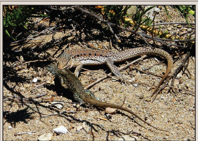
FIG. 1. Saurophagy of Callopistes maculatus on Liolaemus nitidus in central Chile.

CALLOPISTES MACULATUS (Chilean Iguana). SAUROPHAGY ON LIOLAEMUS. The highly endemic reptile diversity of Chile is characterized by lower numbers of lizard species, of predominantly small body sizes (SVL <180 mm), compared to adjacent countries. Among these species, Callopistes maculatus , the largest known lizard (and only teiid) occurring in the country (SVL average: 150.5 \pm 10.9 mm, range [adult size estimated from the largest 2/3 of a 38-specimen sample]: 135–173 mm), and the Liolaemus evolutionary radiation, one of the richest amniote genera on Earth and the richest vertebrate genus in Chile (Pincheira-Donoso et al. 2008. Zootaxa 1800:1–85), stand out as some of the most prominent elements of the indigenous herpetofauna. All