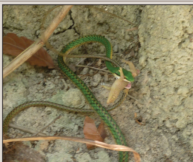
FIG. 1. Adult Leptophis ahaetulla preying upon an adult Bogertia lutzae in Pernambuco, Brazil.

BOGERTIA LUTZAE. PREDATION BY LEPTOPHIS AHAETULLA. Bogertia lutzae is a small bromelicolous lizard (Avila et al. 2010. J. Helminthol. 84:199–201) endemic to the northeast region of Brazil and is found in different ecosystems, mainly inhabiting sandbanks, Atlantic forest, and Caatinga (Rodrigues 1987. Arq. Zool. 1:105–230). Leptophis ahaetulla is a snake with a wide geographical distribution, occurring from southern Mexico to northern Uruguay (Albuquerque et al. 2007. J. Nat. Hist. 41:1237–1243; Carvalho et al. 2007. Biol. Geral Exper. 7:41–59). It is a primarily diurnal and semi-arboreal snake and is reported to occur over a wide range of habitats. The diet of L. ahaetulla consists predominantly of hylid frogs; however, there are also records of Anolis sp., Thecadactylus rapicauda , Mastigodryas boddaerti , and young birds in their diet (Albuquerque et al. 2007, op. cit. ).